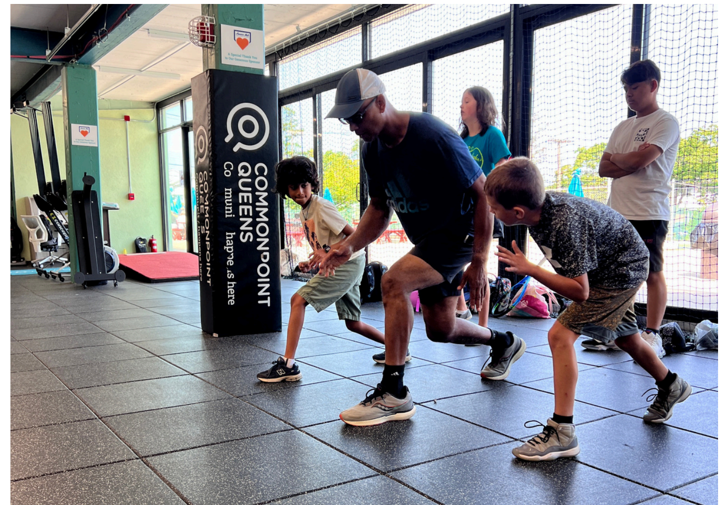
Conditioning and Physical Training